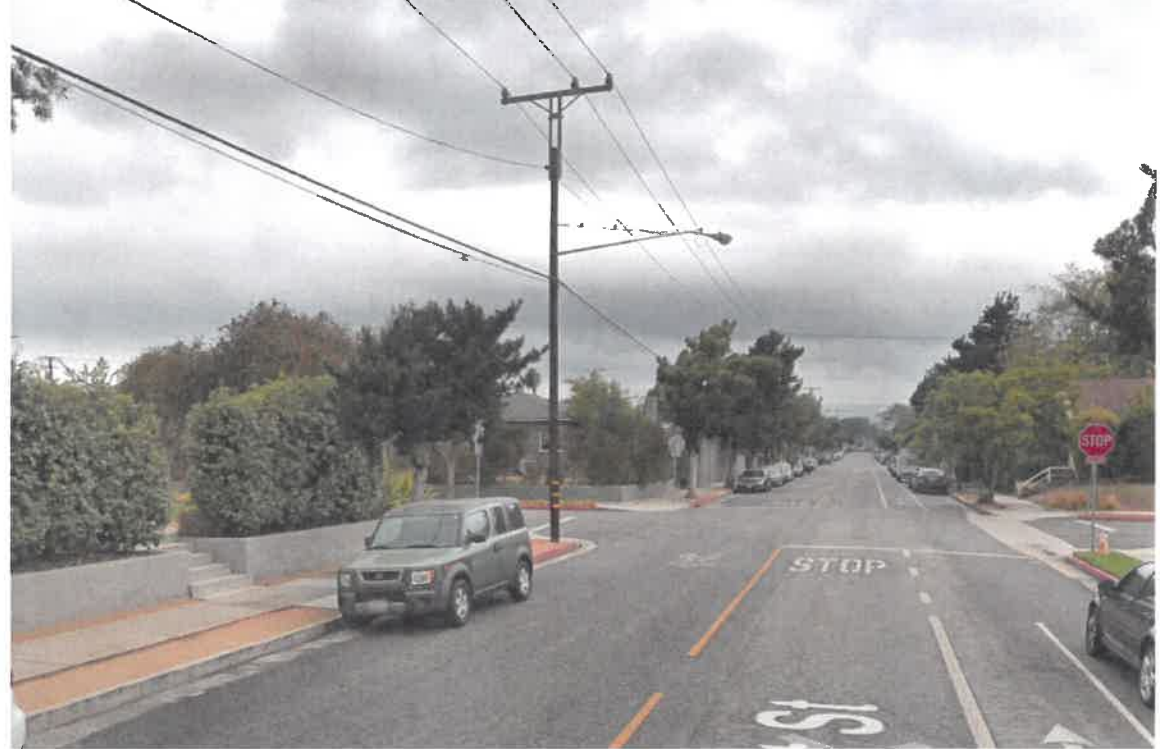
Street view of proposed installation location (looking north on 21st St)