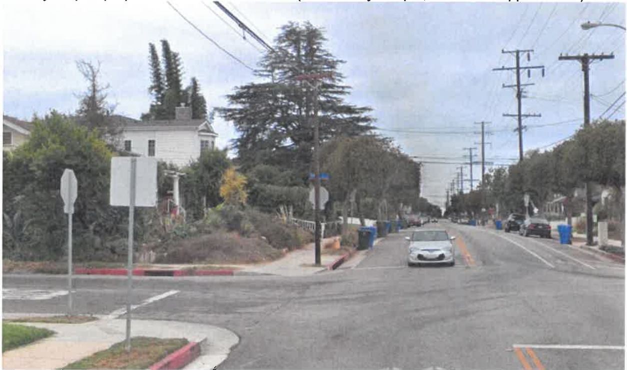
Street view of proposed installation location (looking west on Pearl St)