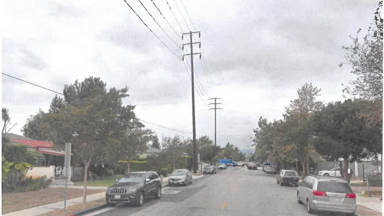
Street view of proposed installation location (looking north on 20 th St)