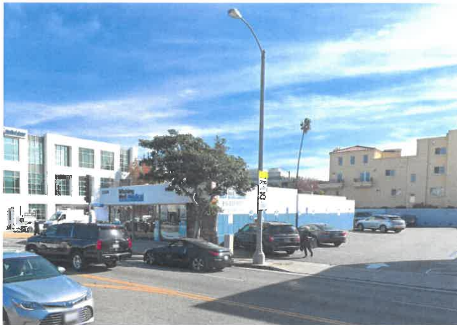
Street view of proposed installation location