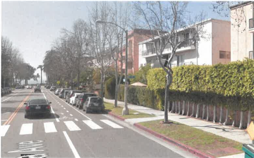
Street view of proposed installation location (looking west on Montana Ave)