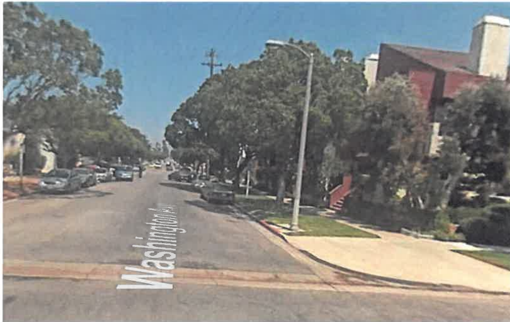
Street view of proposed installation location (looking east on Washington Ave)