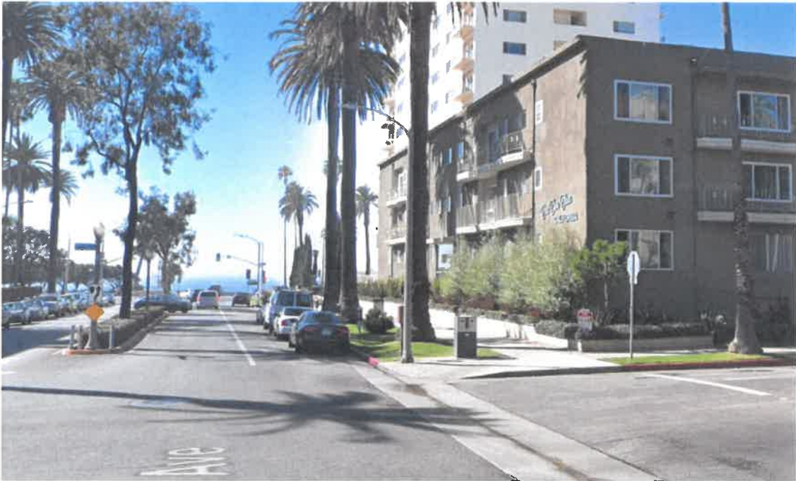
Street view of proposed installation location (looking west on California Ave)