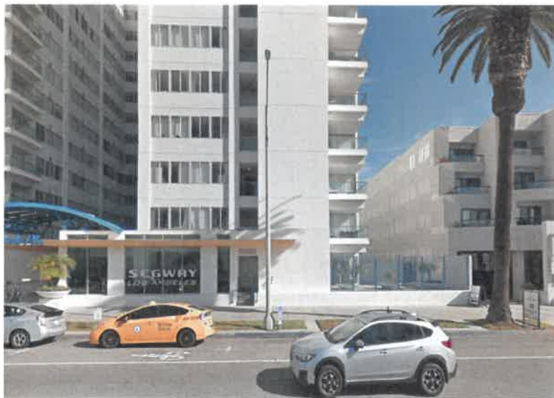
Street view of proposed installation location