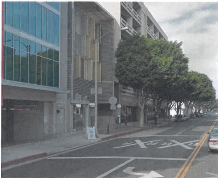
Street view of proposed installation location