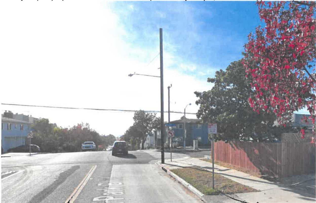
Street view of proposed installation location (looking west on Ocean Park Blvd)