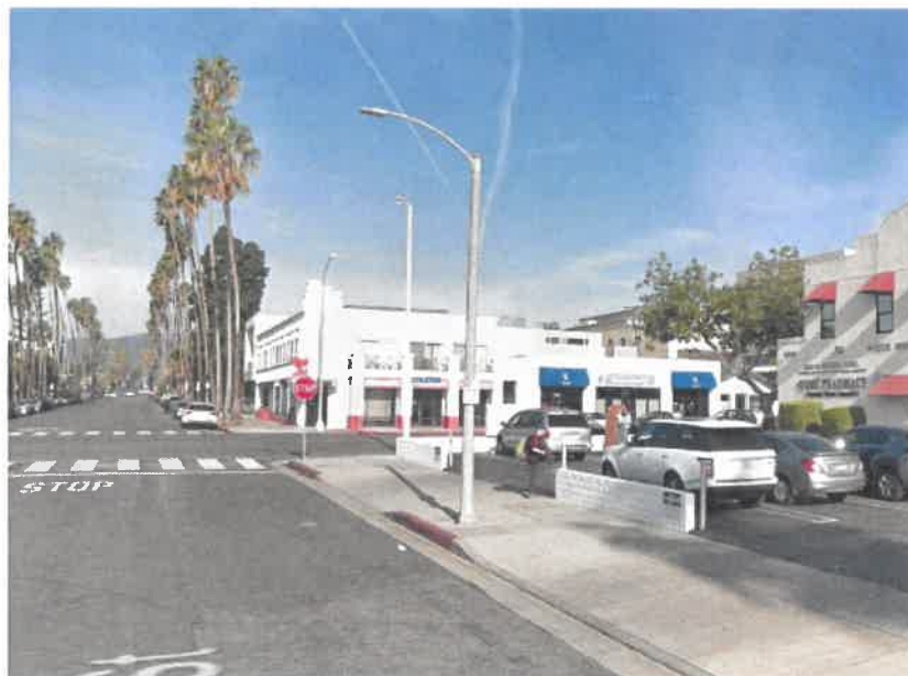
Street view of proposed installation location