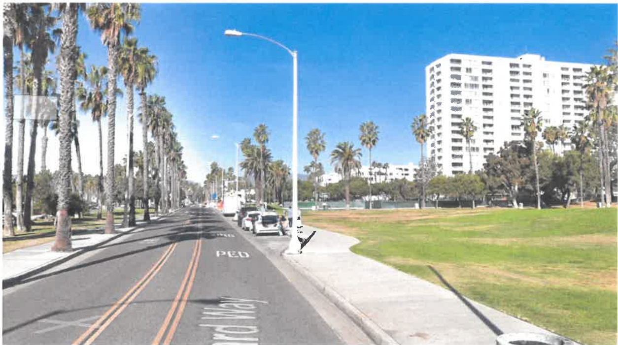
Street view of proposed installation location (looking north on Barnard Way)