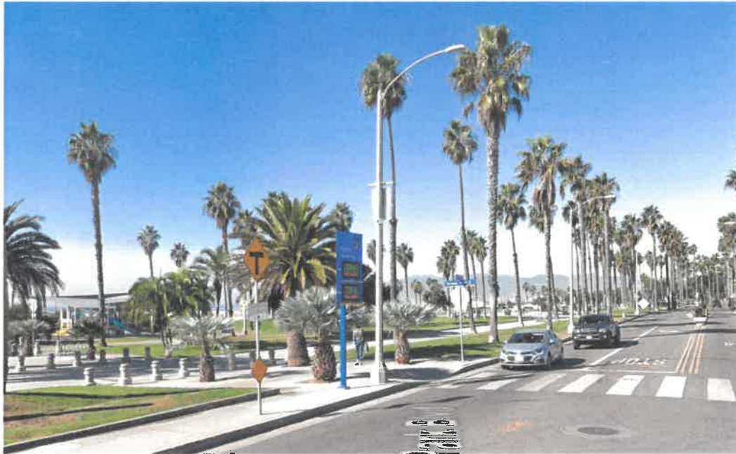
Street view of proposed installation location (looking north on Barnard Way at the northwest corner of the T-intersection of Barnard Way and Ocean Park Blvd)