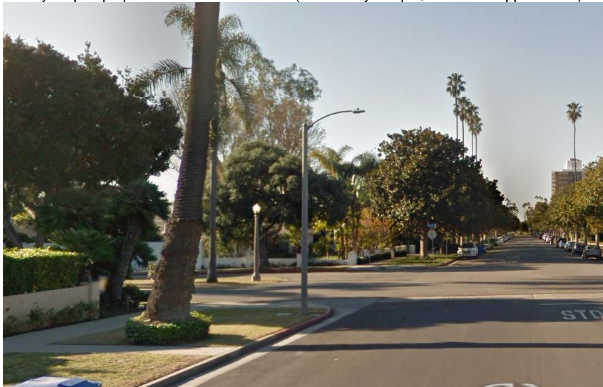
Street view of proposed installation location (looking west on Alta Ave)