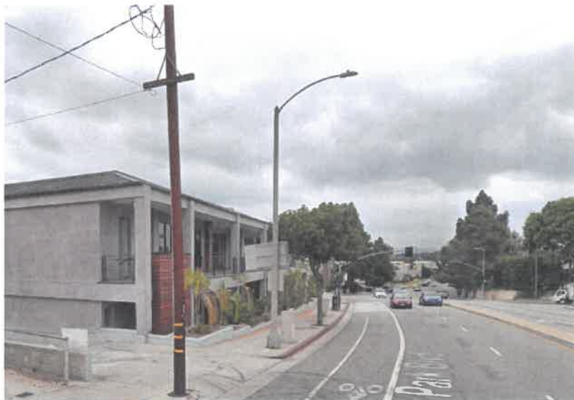
Street view of proposed installation location