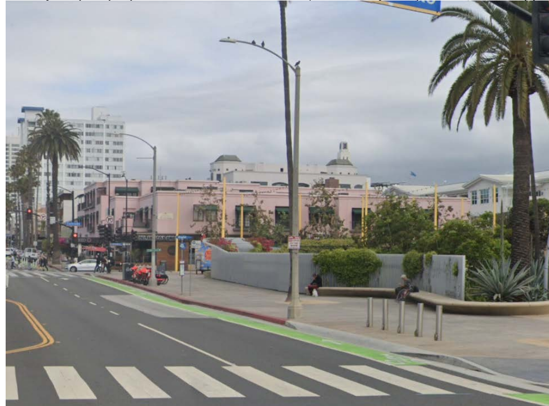
Street view of proposed installation location (looking north on Ocean Avenue)