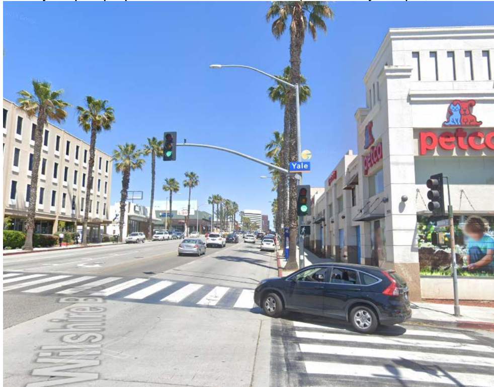
Street view of proposed installation location (looking east on Wilshire Boulevard)