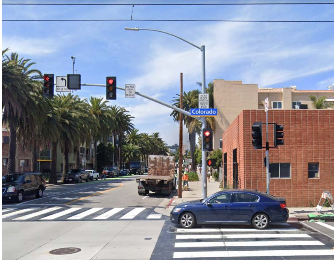
Street view of proposed installation location (looking north on 7 th Street)