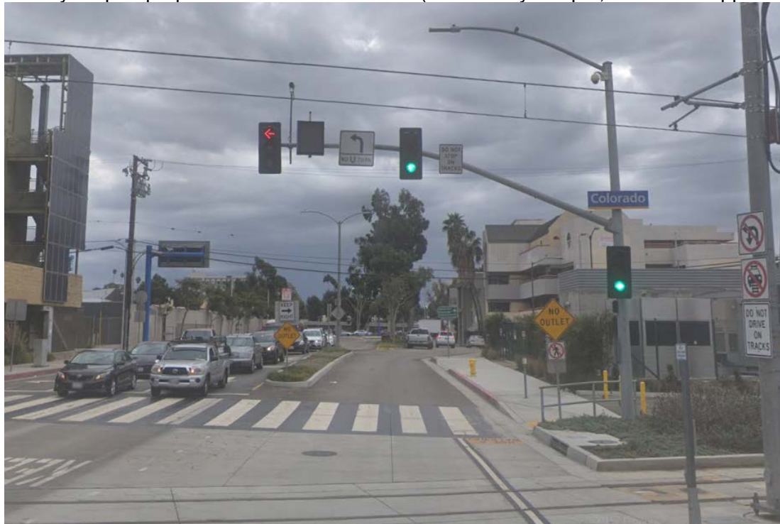
Street view of proposed installation location (looking south on 5 th Street)