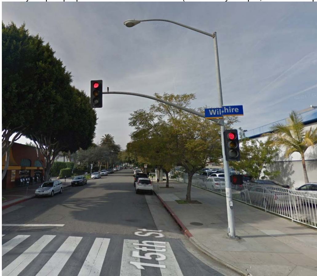
Street view of proposed installation location (looking north on 15 th Street)