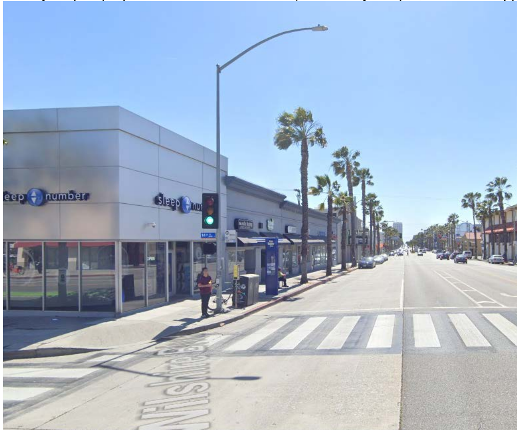
Street view of proposed installation location (looking west on Wilshire Boulevard)