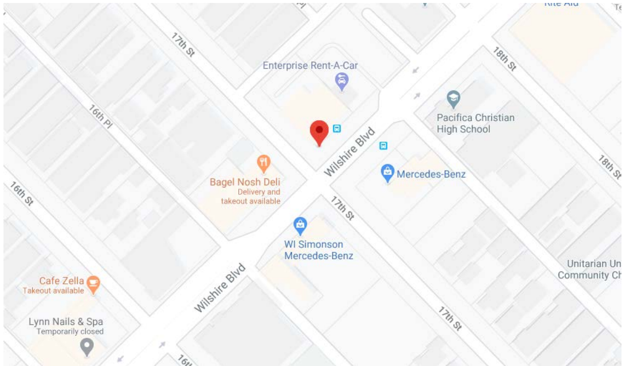
Vicinity map of proposed installation location (denoted by red pin; location is approximate)