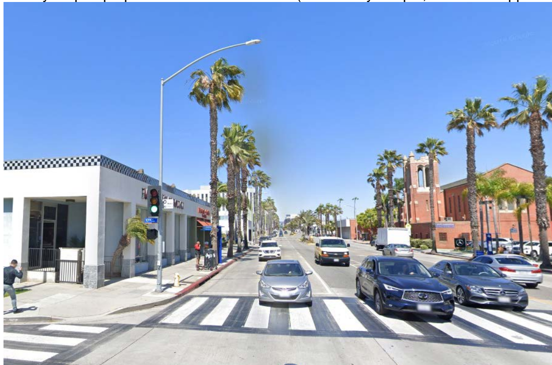
Street view of proposed installation location (looking east on Wilshire Boulevard)