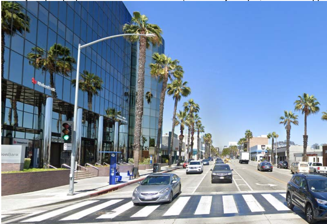
Street view of proposed installation location (looking east on Wilshire Boulevard)