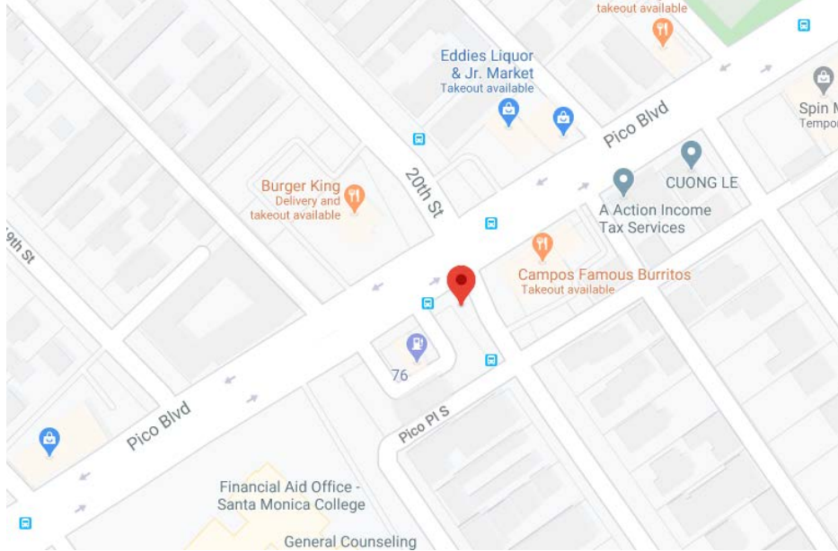
Vicinity map of proposed installation location (denoted by red pin; location is approximate)