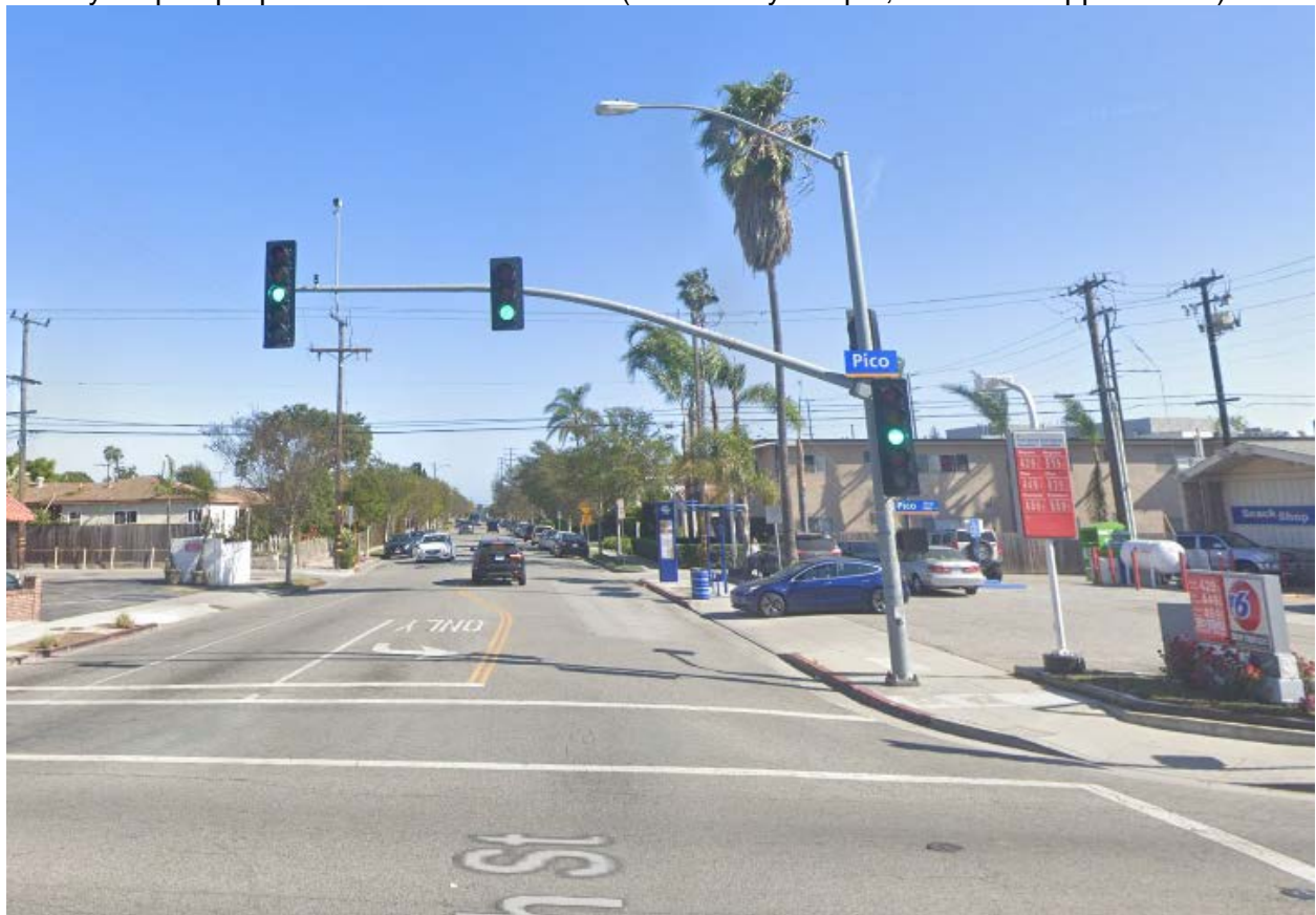
Street view of proposed installation location (looking south on 20 th Street)