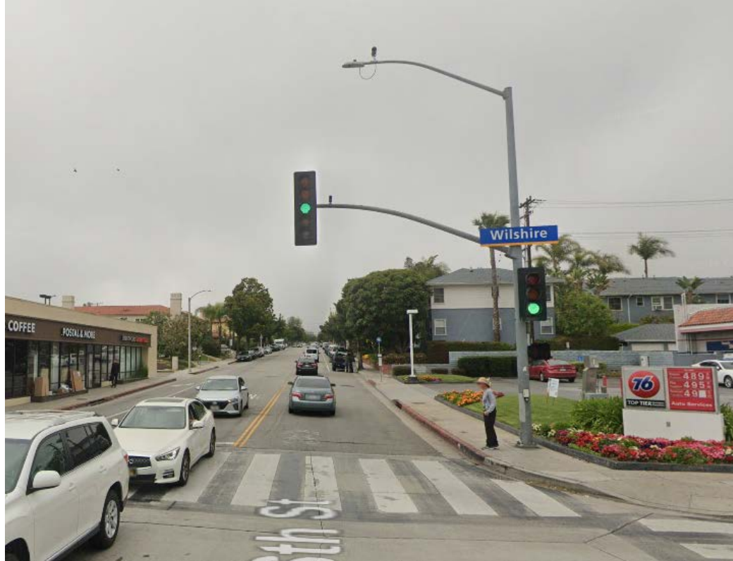
Street view of proposed installation location (looking north on 26 th Street)