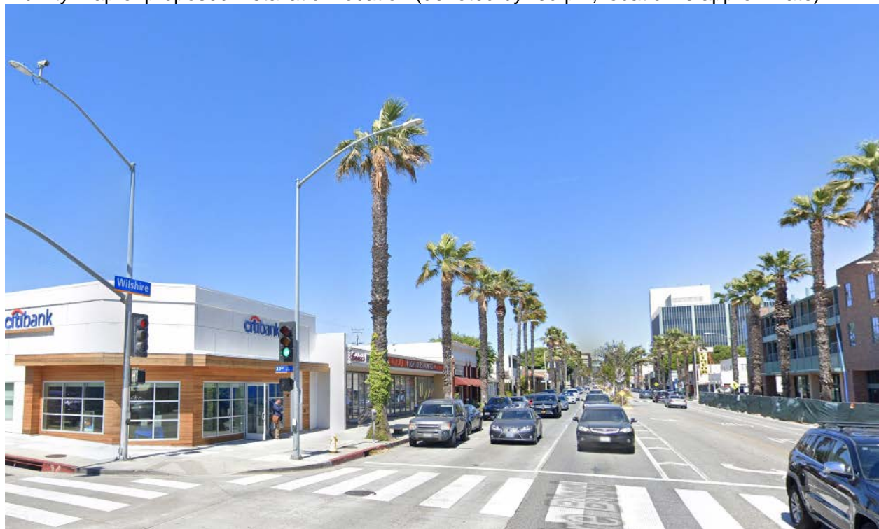
Street view of proposed installation location (looking east on Wilshire Boulevard)