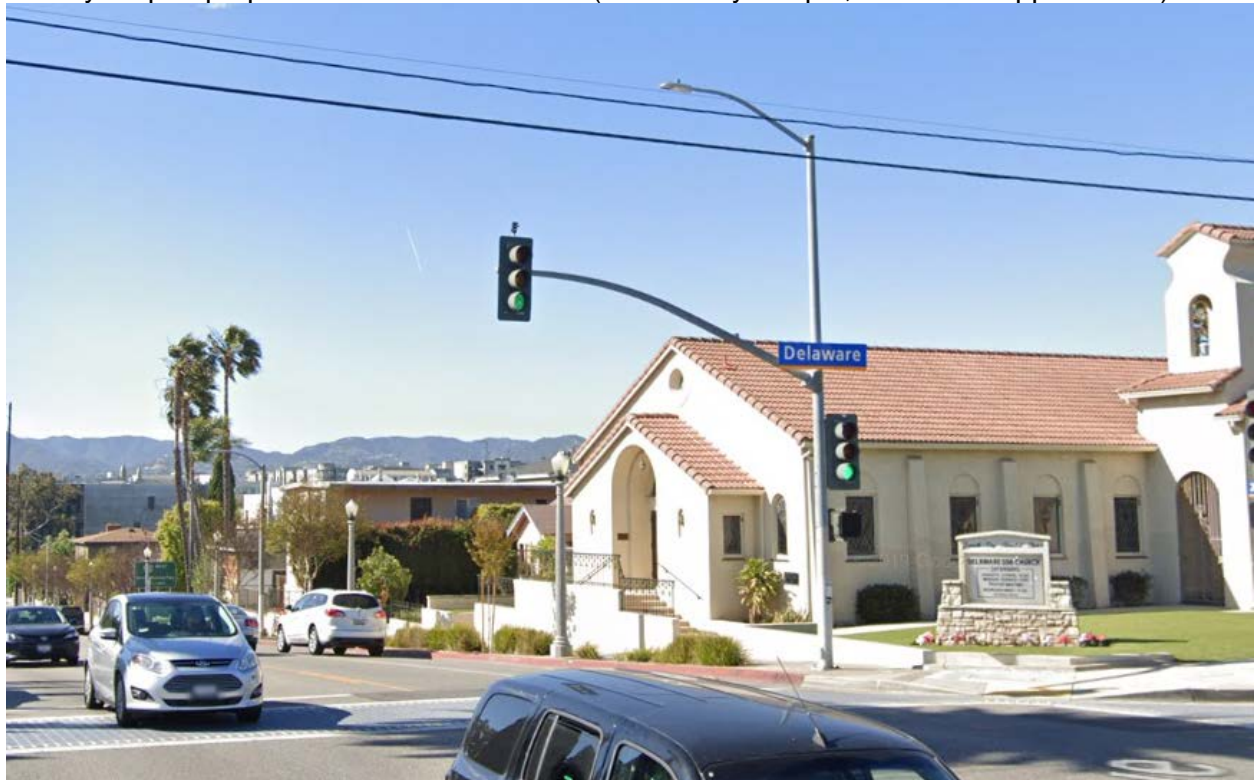
Street view of proposed installation location (looking north on 20 th Street)