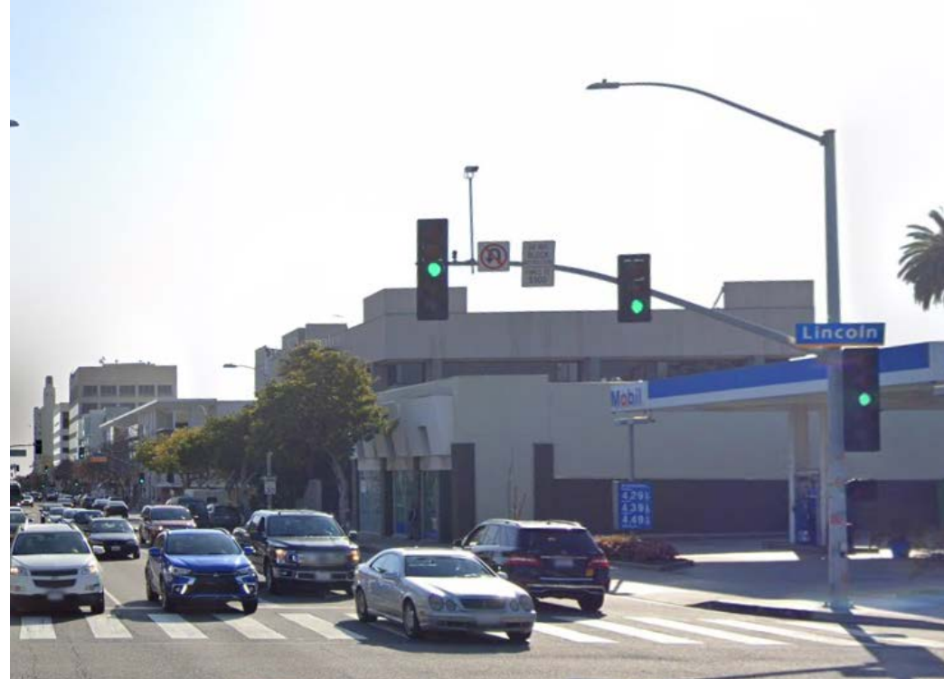
Street view of proposed installation location (looking west on Santa Monica Boulevard)