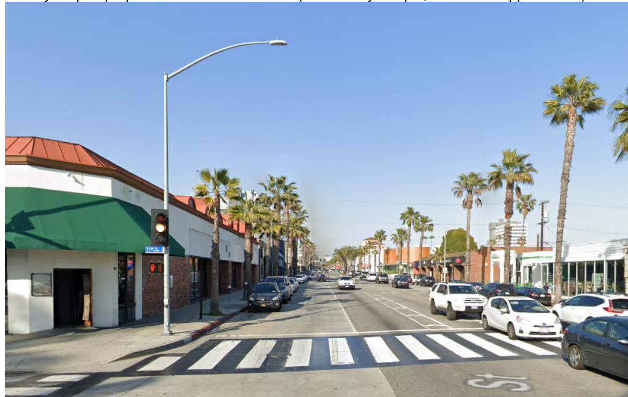
Street view of proposed installation location (looking east on Wilshire Boulevard)