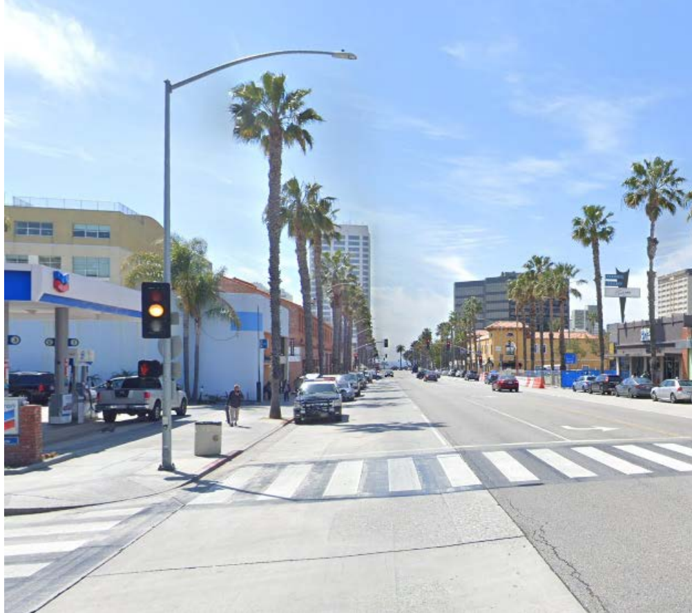
Street view of proposed installation location (looking west on Wilshire Boulevard)