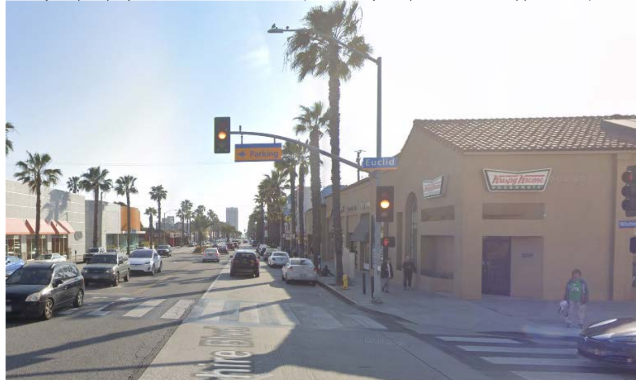
Street view of proposed installation location (looking west on Wilshire Boulevard)