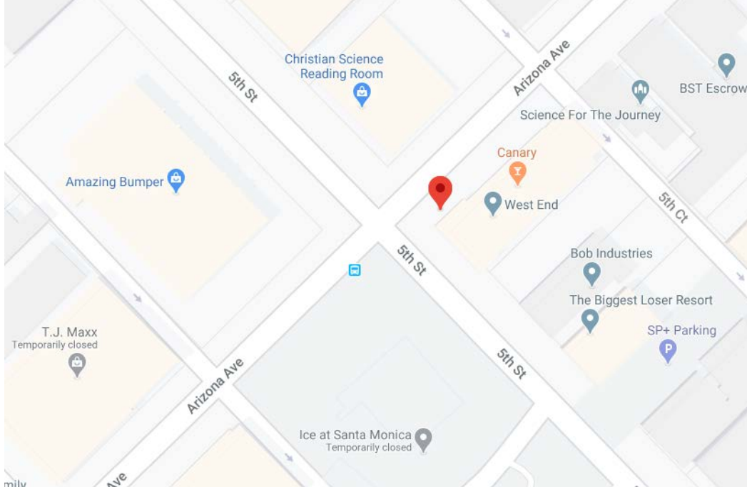
Vicinity map of proposed installation location (denoted by red pin; location is approximate)