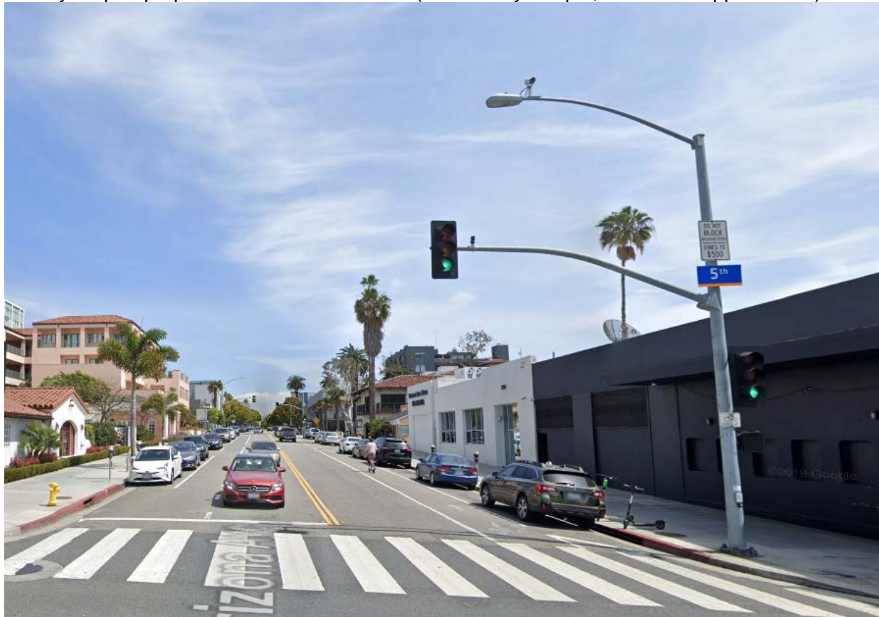
Street view of proposed installation location (looking east on Arizona Avenue)