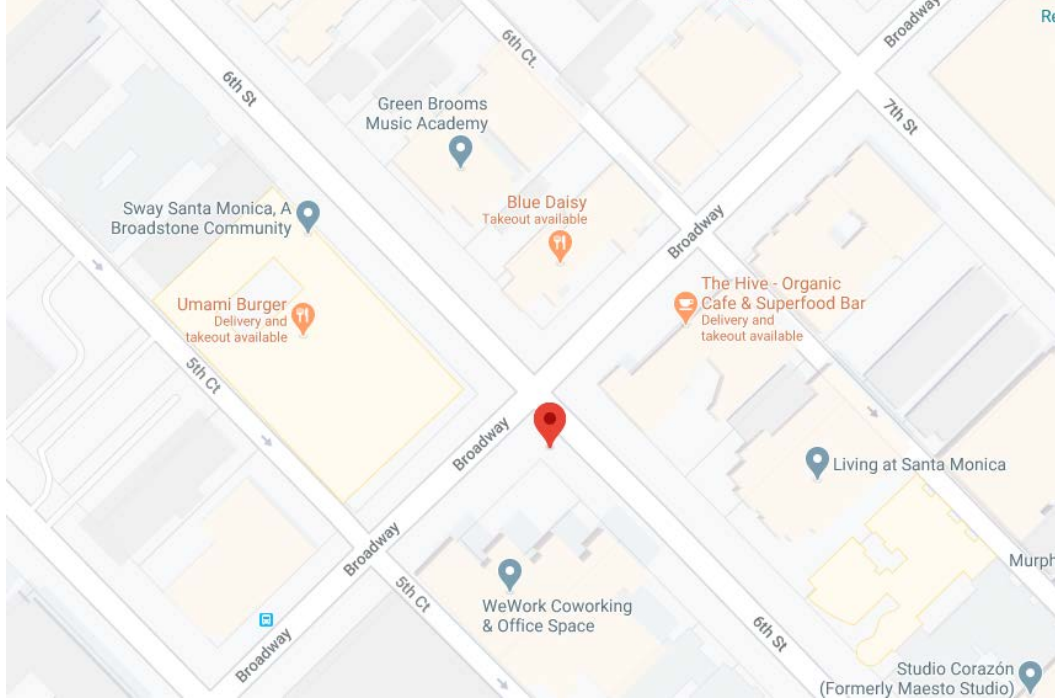
Vicinity map of proposed installation location (denoted by red pin; location is approximate)