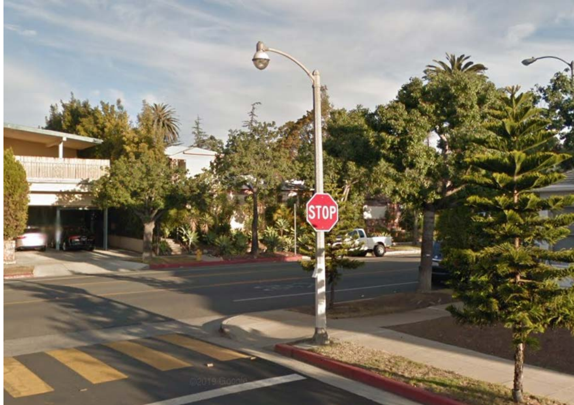
Street view of proposed installation location