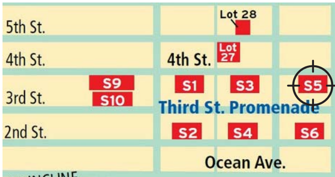
Parking Structure #5 - 1440 4th Street

Beginning Monday, October 15, 2018, Parking Structure #5 will be undergoing repair work to waterproof the Level 2 concrete parking deck. Construction is expected to last for two weeks and will temporarily impact the number of available parking spaces. Entrances and exits to the structure will remain open for smooth traffic flow.