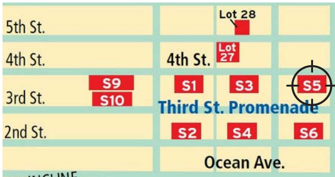
Parking Structure #5 - 1440 4th Street

Beginning Wednesday, June 27, 2018, Parking Structure #5 will be undergoing structural repairs and maintenance work. Construction is expected to last for 2 to 3 months and may temporarily impact the number of available parking spaces. Entrances and exits to the structure will remain open for smooth traffic flow.